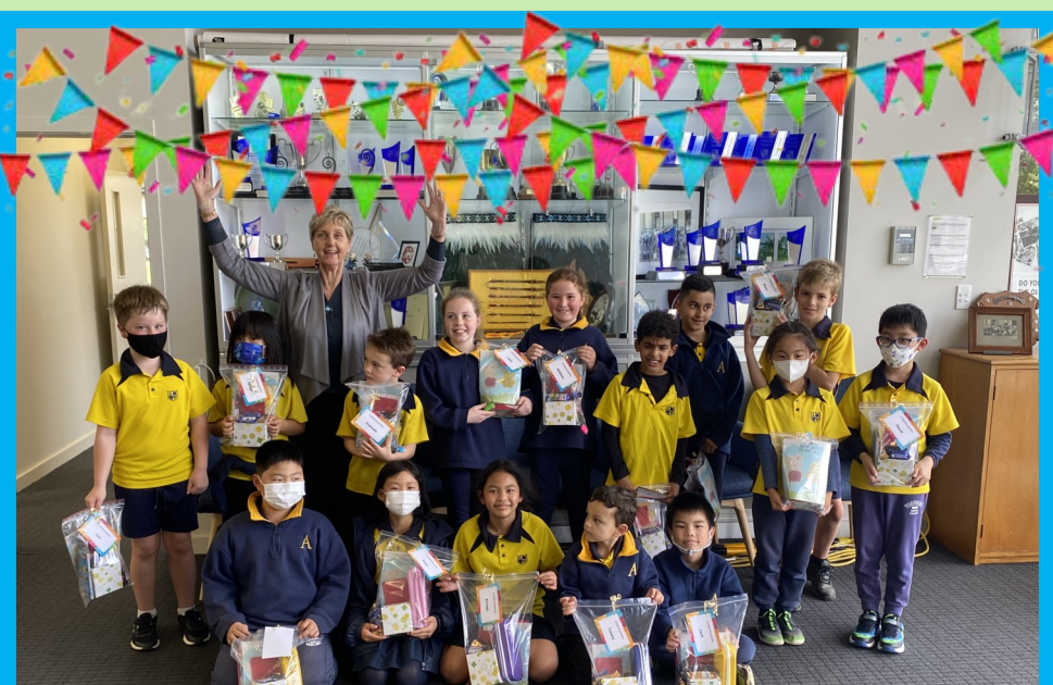
Congratulations to some of our prize winners of the recent 'athon' fundraiser.

*Prices applicable to cash purchases made through Ticketek agents or outlets. Online purchases may attract additional payment processing and delivery fees.