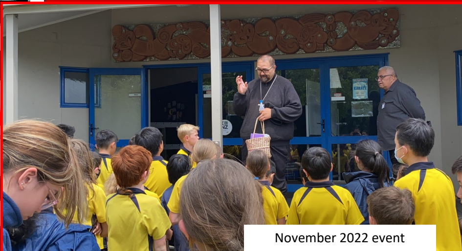
November 2022 event

The waharoa is currently being held in safe keeping in the Principal's office, in readiness for hopefully our new hall/gymnasium.