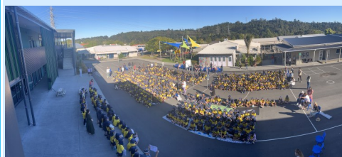
Full School Assembly: Friday 21st March